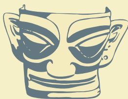
3200 yr old Bronze

Relationships are extremely important in Chinese business. You need to get to know the right people and recognise the power and involvement of the local political leaders in business. Entertainment is a vital part of the business process, where partners get to know each other, whether at a banquet or on a "sightseeing" tour.